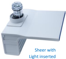
Sheer with Light inserted

Illuminated LED Sheers from Hayward® help transform any pool into a sophisticated aquatic escape with mesmerizing water effects in a variety of colors, shapes and designs made to complement any aesthetic.