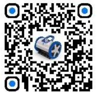
Scan to watch the video

The advanced design optimizes flow performance for use with Hayward variable-speed pumps .