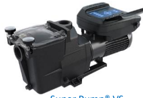
Super Pump® VS

Hayward's Super Pump® VS variable-speed pool pumps are a drop-in upgrade for the single speed pumps.