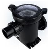
Hi-Capacity Removable Strainer

allows for more adaptable pump configurations, and the oversized strainer basket Reduces cleaning