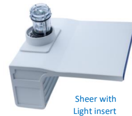
Sheer with Light insert

Illuminated LED Sheers from Hayward® help transform any pool into a sophisticated aquatic escape with mesmerizing water effects in a variety of colors, shapes and designs made to complement any aesthetic.