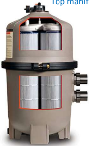
Cartridges with Top manifold

SwimClear filters' top manifold configuration boasts industry-leading hydraulic performance, facilitating