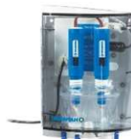
HL-CHEM pH/ORP Sensing

With a simple upgrade to the Omni platform the AquaRite S3 gives you advanced control of all pool and spa features from any computer or smartphone with the intuitive OmniLogic® app. The system can also be built upon at any time with easy-to-add accessories like pH and ORP sensing, Omni-Direct lighting etc.