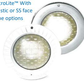
AstroLite™ With plastic or SS face rime options

Designed Exclusively for Swimming Pool Lights, J&J Electronics LED Pool and Spa Replacement Lamps install in minutes and fit into most standard pool light housings offering the ideal ambiance for playing, relaxing, or entertaining, while providing immediate energy cost savings over traditional incandescent pool lamps.