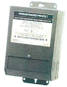
12V/300W ProHayward Transformer

ProHayward low voltage swimming pool transformers are the preferred transformer around the world.