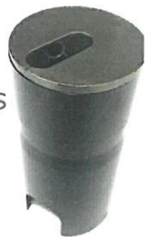
Deck Jet 500

Bring the beauty of moving water to your customer's backyards with Hayward's new family of water features.