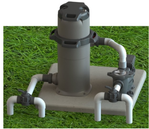
Step 4: Plumb pump outlet to filter inlet (45 degree plumbing recommended for hydraulic efficiency).