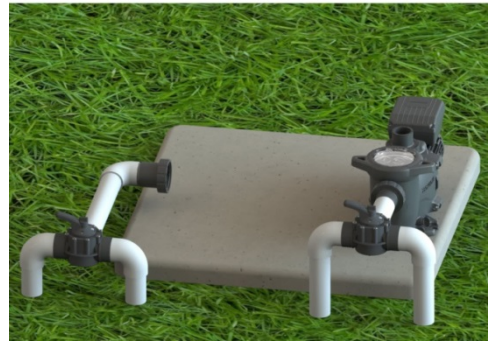
Step 2: Plumb new filter outlet union & remove pump outlet plumbing. Note: SwimClear outlet is same height as StarClear Plus.