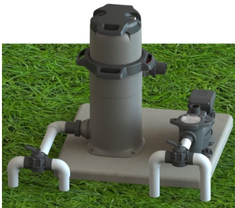
Step 3: Connect SwimClear to outlet union.