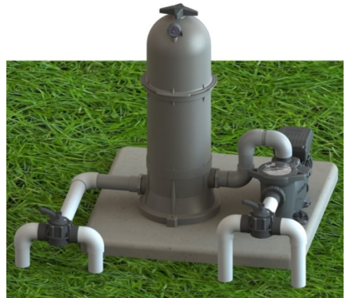
Existing StarClear Plus filter to be replaced.

For additional assistance, please contact Hayward Technical Service at (908) 355-7995.